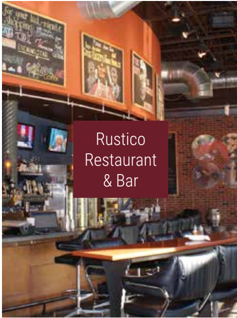
Rustico Restaurant & Bar