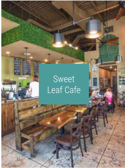
Sweet Leaf Cafe